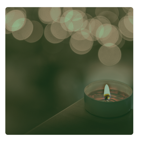
Class Memoriam Parkway Alumni Association extends condolences to family and friends of the following Parkway alumni and staff. <u>CLICK HERE to read more.</u>